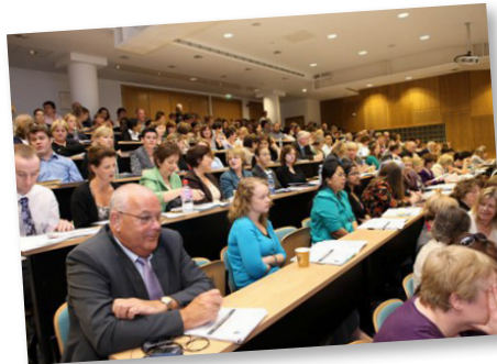
WEAAD 2011 audience at UCD