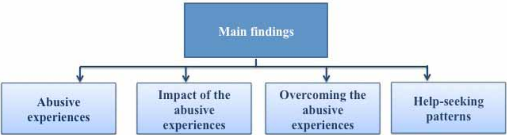
Figure 4.1 Overview of main findings

Findings are presented in four main categories, namely ‘abusive experiences’, ‘impact of the abusive experiences’, ‘overcoming the abusive experiences’ and ‘help-seeking patterns’ (Figure 4.1). The category ‘abusive experiences’ describes the range and type of abusive behaviours experienced by participants and comprises five main themes, as follows: assault and restraint; theft, undue influence and financial deceit; misuse of and damage to personal property; denial of help and support; verbal abuse and prevented from seeing grandchildren. The category ‘impact of the abusive experiences’ describes the ways in which the abuse impacted on participants’ health and wellbeing and consists of three main themes, namely: impact on physical health; impact on emotional health; and impact on social circumstances. The third category ‘overcoming the abusive experiences’ describes the type of coping mechanisms employed by participants and encompasses six themes: avoidance; confrontation; personal strengths; affirmation; a place of sanctuary; and rationalising the abuse. The final category ‘help-seeking patterns’ presents the type, source and experiences relating to accessing help and support. This category comprises three themes: help-seeking patterns; help and support received; and barriers to accessing help and support.