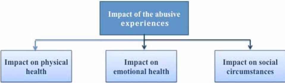
Figure 5.1 Impact of the abusive experiences

Another participant recalled how she had suffered from hair loss, which she attributed to the stress associated with her abusive experiences: