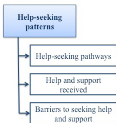
Figure 7.1 Help-seeking patterns

This category describes the help-seeking patterns and pathways evident in participants' abusive experiences as well as the source and type of support received by participants. It also identifies a number of obstacles related to accessing help and support, which the participants experienced. Three main themes emerged from the data related to this category: help-seeking pathways, help and support received, and barriers to seeking help and support (Figure 7.1).